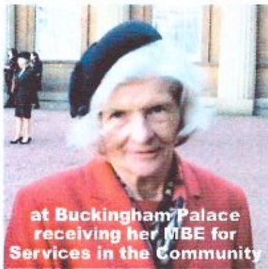
at Buckingham Palace receiving her MBE for Services in the Community