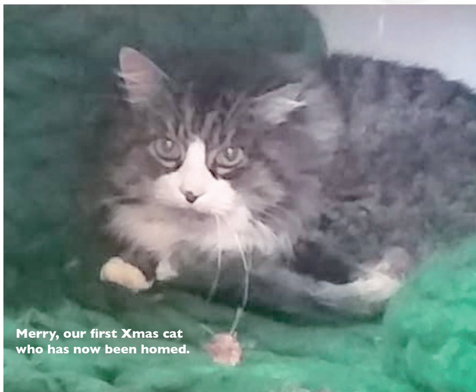
Merry, our first Xmas cat who has now been homed.